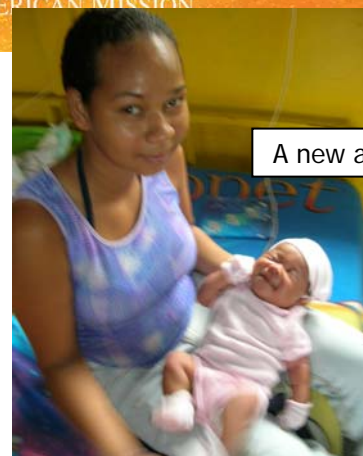
A new arrival