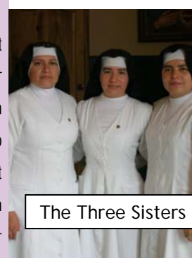
The Three Sisters